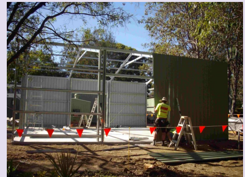
The slab went down at the end of April, the frame on Thursday 12 May, the