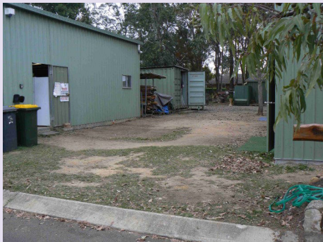
2. Clear the area.