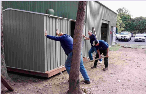
1. Roll the office out of the way.