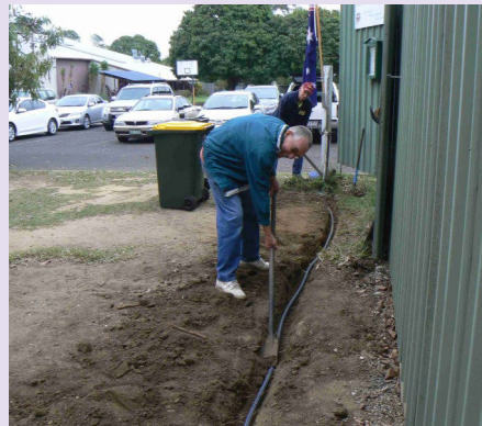
3. Connect the office to the water supply.