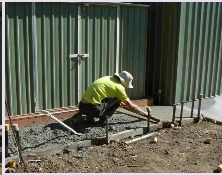
5. Concrete a step into the office.