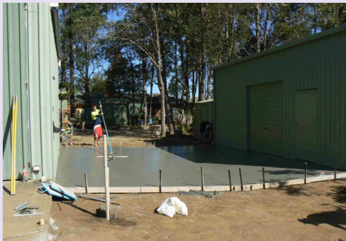
4. Concrete between the two sheds.