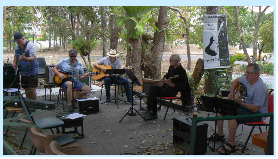
Then we have the group for you! Each fortnight our group comes together to bash out a few tunes from the Sixties, Seventies (and even the Eighties). Take note! The next one is on support live music Saturday 9 February 10 a.m. to 12 p.m.

Do you enjoy listening to Live Music? Can you tap your foot in time? Do you play guitar, keyboards or the drums? Can you sing - out of the shower?